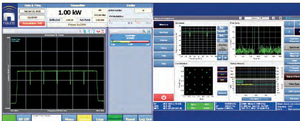
Figure 1. Six DRM signals combined in a Nautel GV transmitter.

The narrow bandwidth of 96 kHz makes DRM well suited for exploiting whitespace within busy FM allocations and allows it to be injected into standard channel combiner